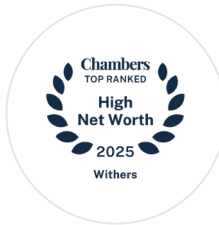
Chambers & Partners Top ranked in HNW 2025