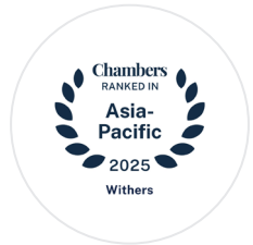
Chambers & Partners Ranked in Asia-Pacific 2025